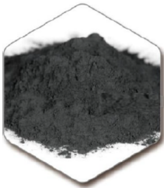
Black flocculent powder