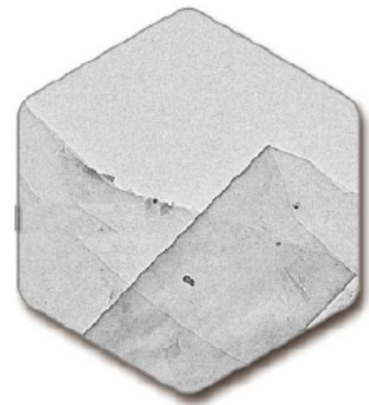
Transmission electron microscope photograph